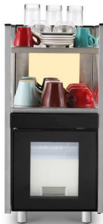
Cooler & Warmer Cup Rack