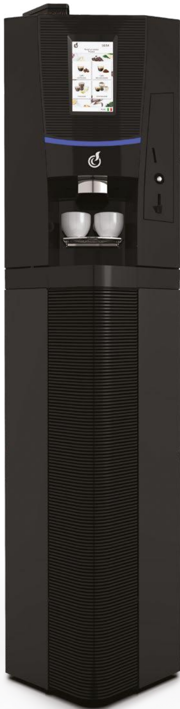
TALIA TOUCH 7" + BLACK CABINET