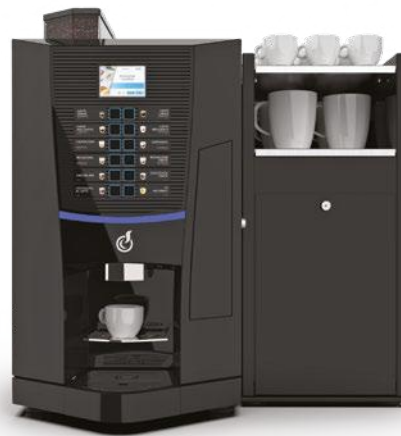
TALIA EASY + FRESH MILK MODULE (optional accessory)

TALIA, the semi-automatic solution to create a complete and efficient coffee area with a design capable of enhancing any environment.